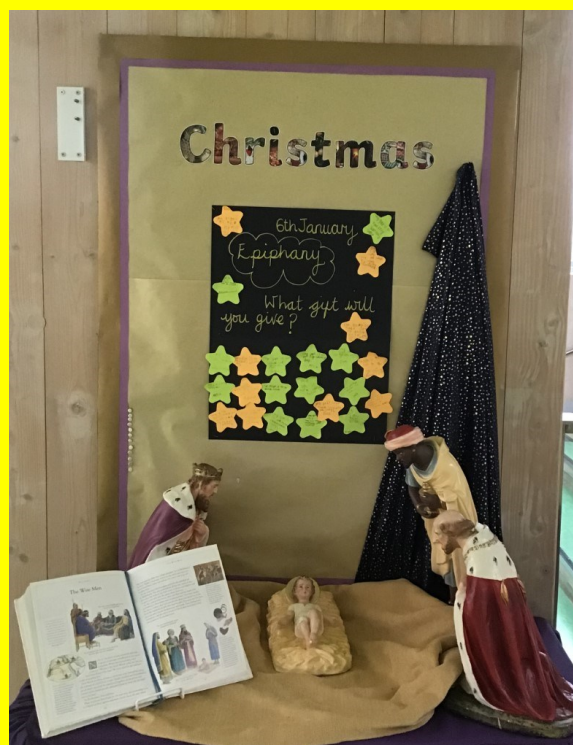
Thank you to 2KM for the beautiful Epiphany display.

On Thursday, we celebrated the feast of the Epiphany in school. The children learned that the word 'epiphany' means to reveal and on this feast day we are reminded that God chose to reveal His son, Jesus, to the wise men, who were Gentiles and came from another country. This revelation is really important because the Jews and Gentiles were enemies. God wanted the people to know, right from the beginning, that he loves everyone regardless of what their religious beliefs are or where they are born.