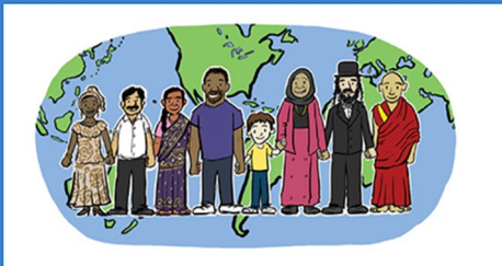
Little Way Catholic Educational Trust