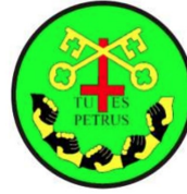
St Peter's Gloucester