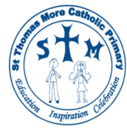
St Thomas More Catholic Primary Cheltenham