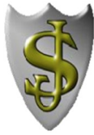
St Joseph's Nympsfield