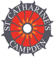
St Catharine's Chipping Campden