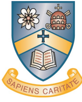
Catholic School of St Gregory The Great, Cheltenham