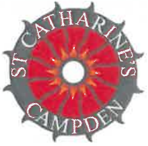
St Catharine's Chipping Campden