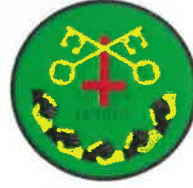
St Peter's Gloucester